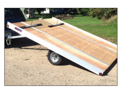
GVWR: 2950 lbs 12' Trailer weight - 550 lbs 12' Tilt load capacity -2400 lbs