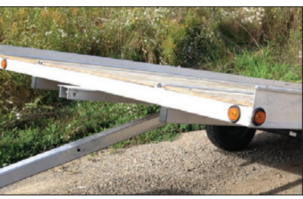
Heavy Duty tongue with guide improves turning radius

ProStarr Trailers come standard with either our Heavy Duty tongue with guide/housing, or you can choose our New Wishbone tongue. Either tongue choice is designed to be the strongest in the industry.